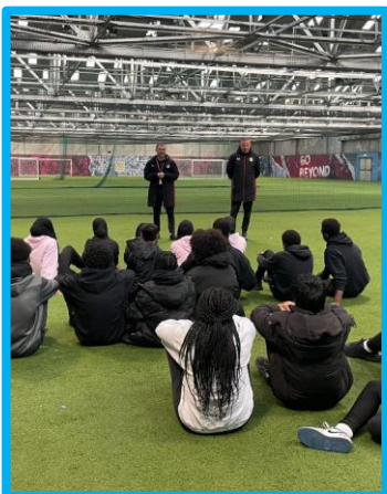
Aston Villa Foundation coaches discussing their coaching journey with students.