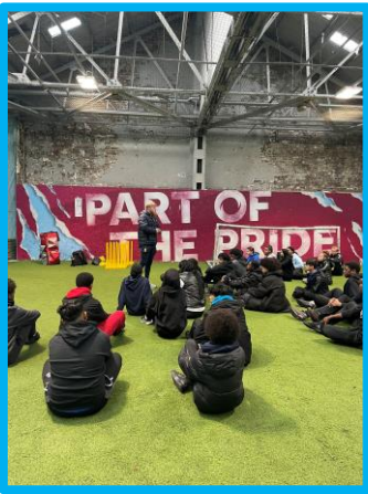
Aston Villa Academy staff discussing the roles and career pathways available at the club.