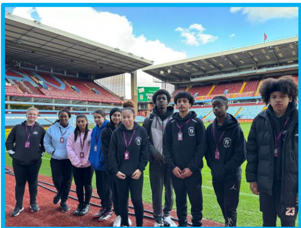
Students touring Villa Park and learning about potential careers in sport.

“Future Prospects has made me realise that I can have the career I want in sport.” Year 10 student