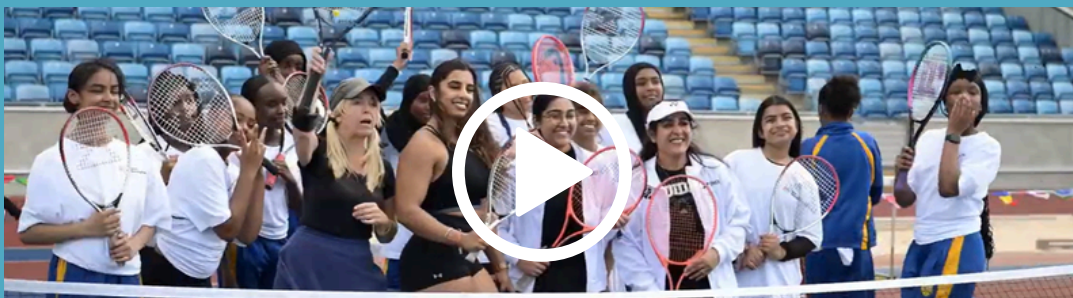
Girls of Brum video

'I think initiatives like this are so empowering it's all about the next generation. Encouraging girls and young women to get into Sport and amazing days like this are where the seeds are planted'.